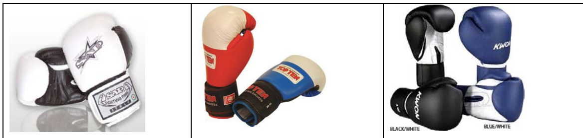
Appendix 3: Shin Guards.