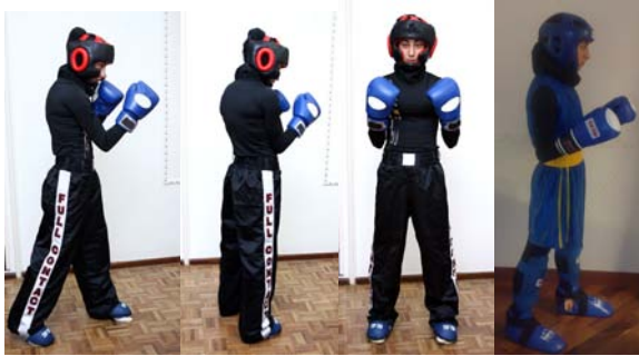
Appendix 1: Full Contact Clothing

Female Muslim athletes participating in any WAKO competition under the conditions described above must give their written consent to WAKO that in case of emergency (injuries, cuts etc.); the medical staff on duty can proceed to any examination of the case if needed.